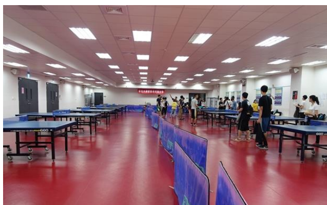
12 tables for practice at 1 st Floor of the venue